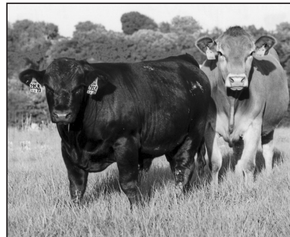
Man oh man, note the powerhouse bull calf on this Judd Ranch first-calf heifer.