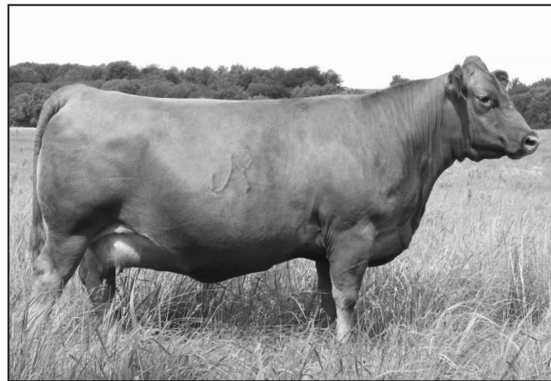
JRI Ms Hot Pursuit 207U33 is a many-time honored Judd Ranch Dam of Merit female known for producing tremendous daughters and beef machine sons. To date, 207U33's six beef machine sons have averaged a scalebusting 989 pounds on actual weaning weight.

Herd consultant Roger Gatz of Cattlemen's Connection adds, "No matter what breed we're talking about, Judd Ranch has some of the best females in the country. If you want to produce moderate-framed, highly efficient, highly fertile replacement heifers that excel in teat and udder structure, then be at this sale and take home a Judd Ranch bull." ❖