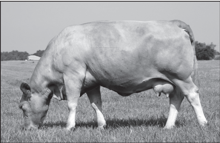
This Judd Ranch female was photographed at 12 years of age. Yes, longevity, fertility and teat and udder excellence are all part of “The Complete Package”.