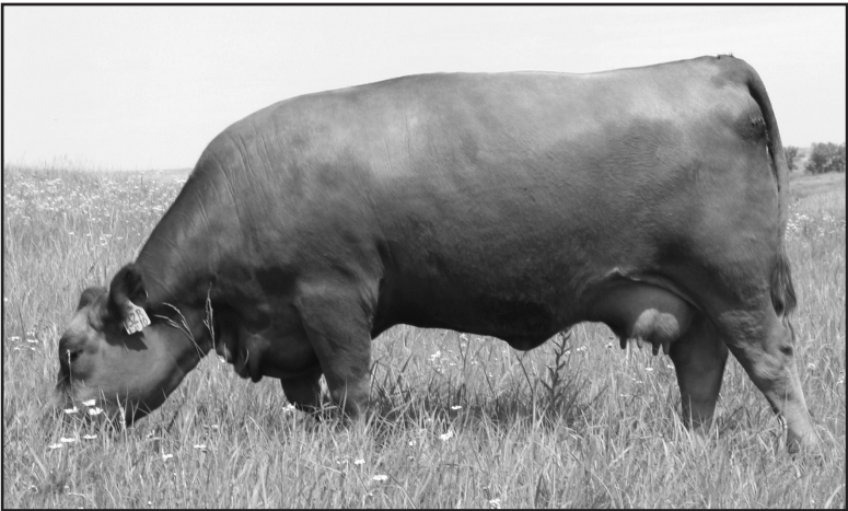
This Judd Ranch beauty was photographed as a first-calf heifer and wowsa, note her natural fleshing ability and teat and udder excellence.