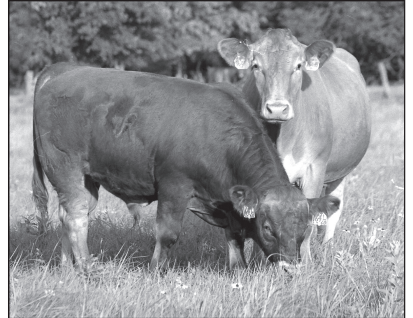
Oh my, look at the bull calf on this honored Judd Ranch Dam of Merit female.

been DNA tested have proven to be homozygous polled. This year's sale features 278 homozygous polled bulls — bulls that can help Judd Ranch customers add profit to their calf crop. ❖