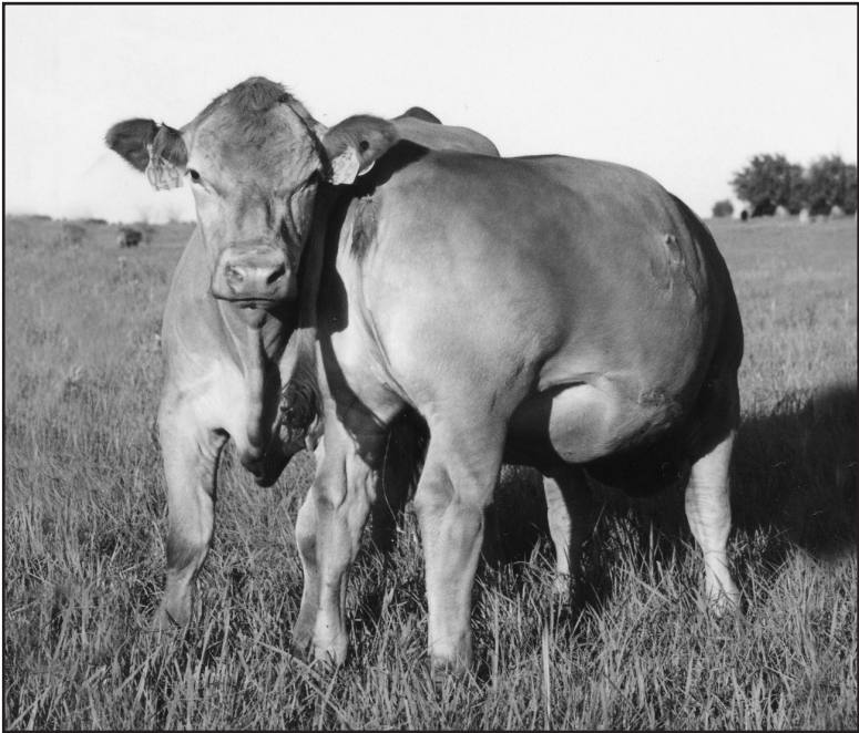
Oh my, look at the whopping heifer calf nursing this Judd Ranch honored Dam of Merit mama. Cow efficiency is all part of “The Complete Package” at Judd Ranch.