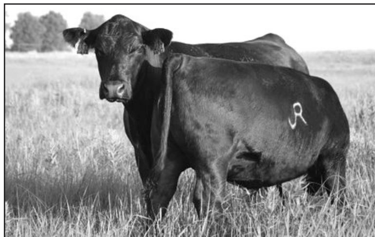
Oh man, look at the awesome heifer calf nursing this Judd Ranch first-calf heifer.