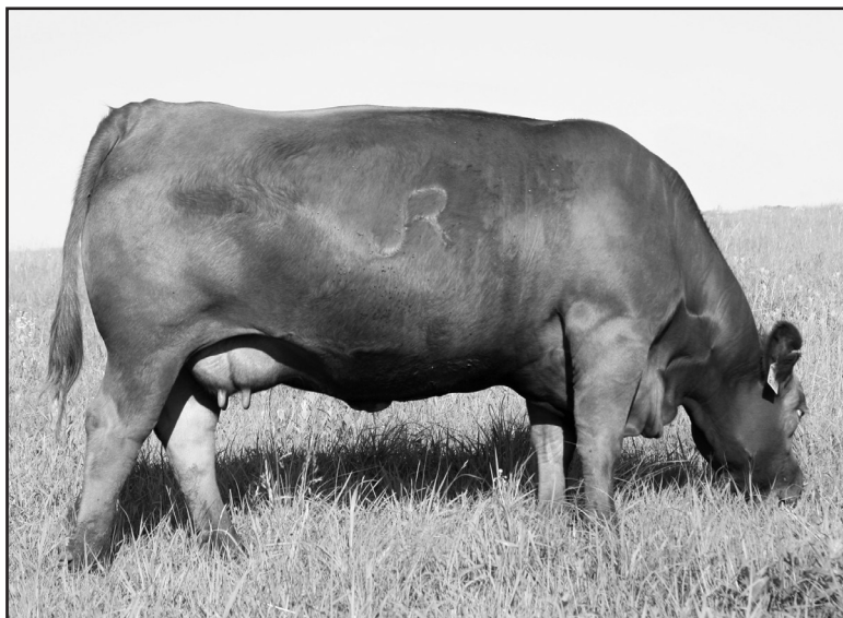
This many-time honored Judd Ranch Dam of Merit female JRI Ms Freedom 9M11, produced big ol' strapping calves for 15 plus years.