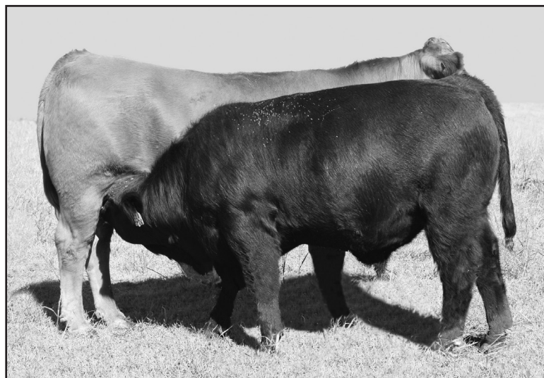
Whoa, look at the bull calf nursing this Judd Ranch first-calf heifer.

"The objective," Weaber summarizes "should be to optimize everything except profit. Profit is what we want to maximize." ❖