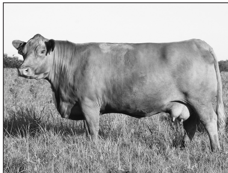
Oh man, check out this beautiful 7-year-old Judd Ranch mama, JRI On Cue 254B93 and she's mighty fertile with a 355-day annual calving interval.

Jenkins is sold on Judd Ranch bulls. Increased weaning weights, improved docility and daughters that are easy keepers, good uddered, good legged and raise good calves keep him coming back. "I am very pleased with the Gelbvieh influence on my cow herd," Jenkins summarizes. ❖