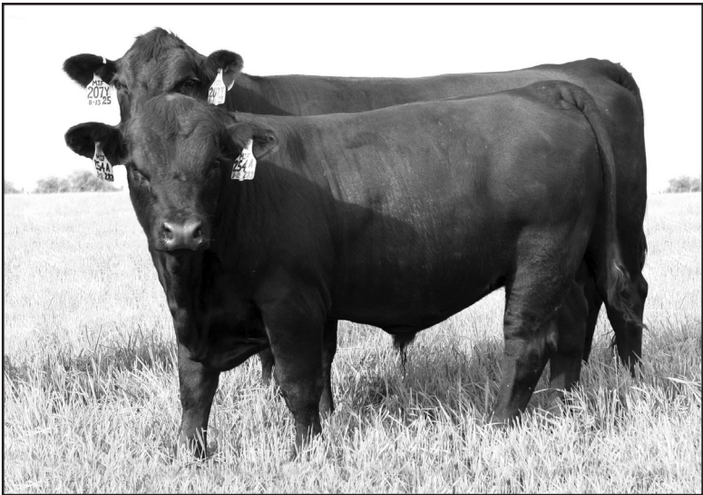
Judd Ranch genetics are bred to perform and note the meat machine bull calf at the side of this first-calf heifer.