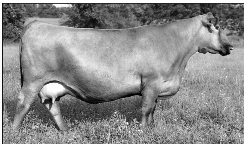
Judd Ranch's purebred 1A Red Angus genetics possess the same natural fleshing ability and teat and udder excellence as their breed-leading Dam of Merit Gelbvieh and Balancer program. This foundation purebred Red Angus female's red, homozygous polled Balancer grandson, JRI Sir Loin 47H37 sells March 5. Sir Loin's stats: 881 lb. 205-day weight, 1,080 lb. actual weaning weight off his first-calf dam and the meat machine hammered the yearling weight scales at 1,359 pounds.

Editor's Note: The 170 fall bulls selling in this year's sale averaged 37.7 centimeters on yearling scrotal. Industry average for bulls measured at one year of age should be at least 32 centimeters, and preferably 34 to 36 cm. Because the spring-born bulls will not be measured until January, their scrotal circumference average was not available at the printing of this publication. Each yearling bull's scrotal circumference measurement will be printed in the sale catalog. ❖